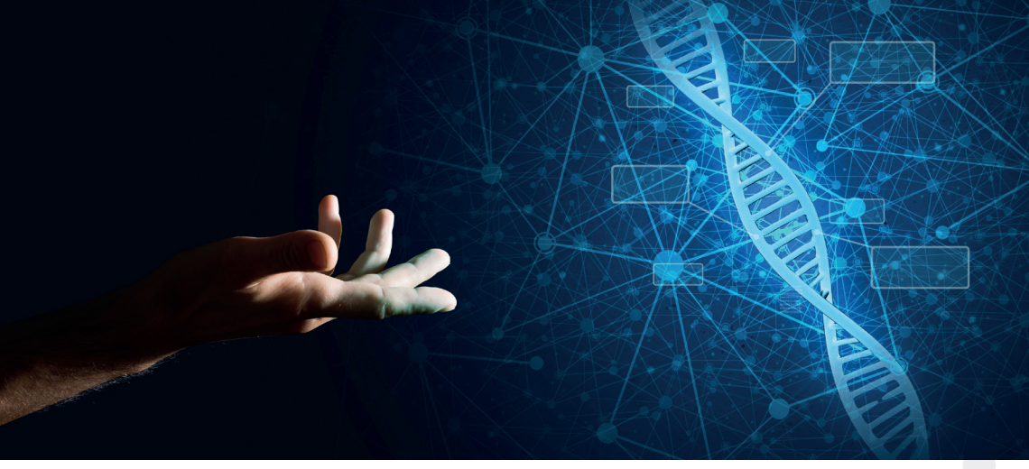
Fasteris, a DNA sequencing solution