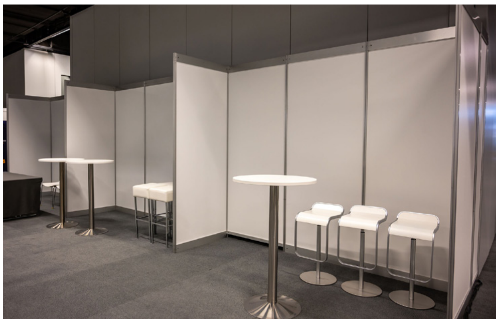
example of a booth set-up

For parking during the conference, you can order parking tickets in the online ordering shop. The car park is located at Messe Basel, Riehenstrasse 101, 4058 Basel. You may drive into the parking garage and take a ticket upon entry. During the event, a congress center representative will provide you with the ordered exit ticket.